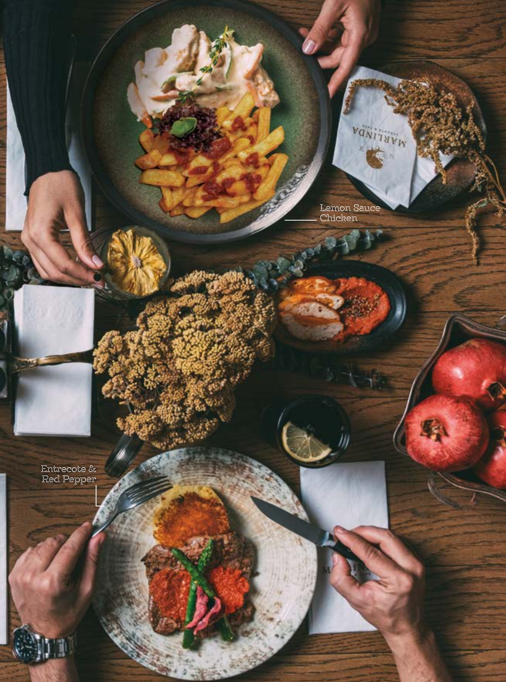
Lemon Sauce Chicken