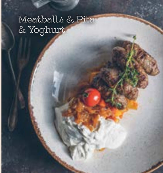
Meatballs & Pita & Yoghurt