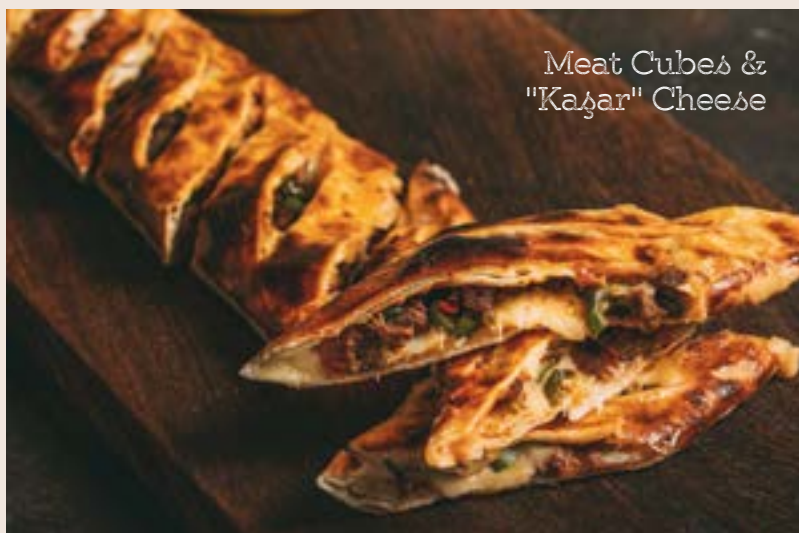
Meat Cubes & "Kaşar" Cheese