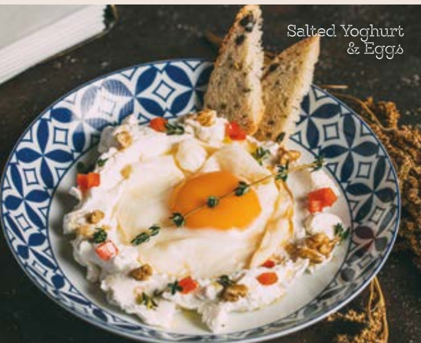
Salted Yoghurt & Eggs