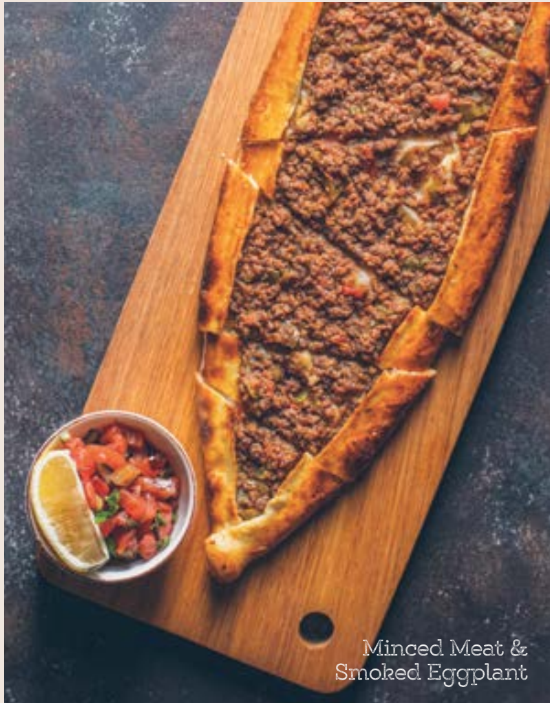
Minced Meat & Smoked Eggplant

"Sucuk", salami, sausage, sweet corn, sliced olives, butter-sauteed tomato sauce, green peppers, 'kaşar' cheese