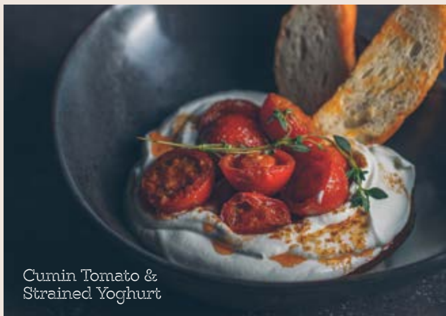
Cumin Tomato & Strained Yoghurt