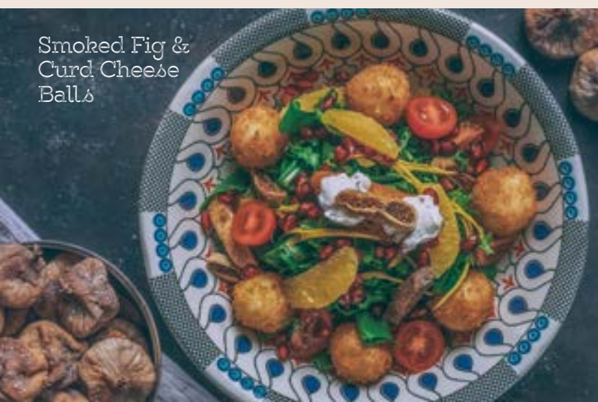
Smoked Fig & Curd Cheese Balls