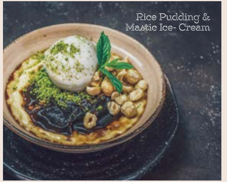
Rice Pudding & Mastic Ice- Cream