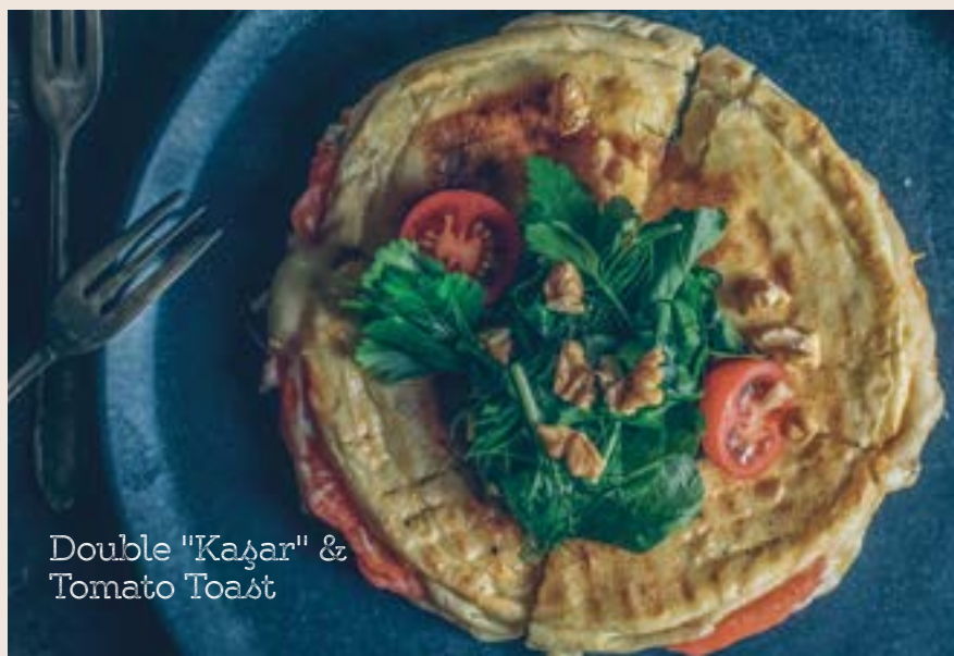
Double "Kaşar" & Tomato Toast