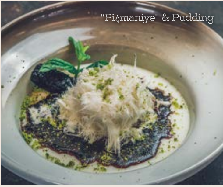
"Pişmaniye" & Pudding