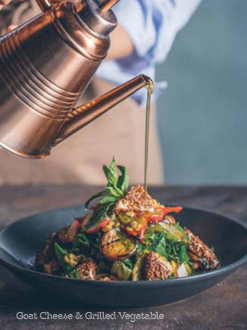
Goat Cheese & Grilled Vegetable