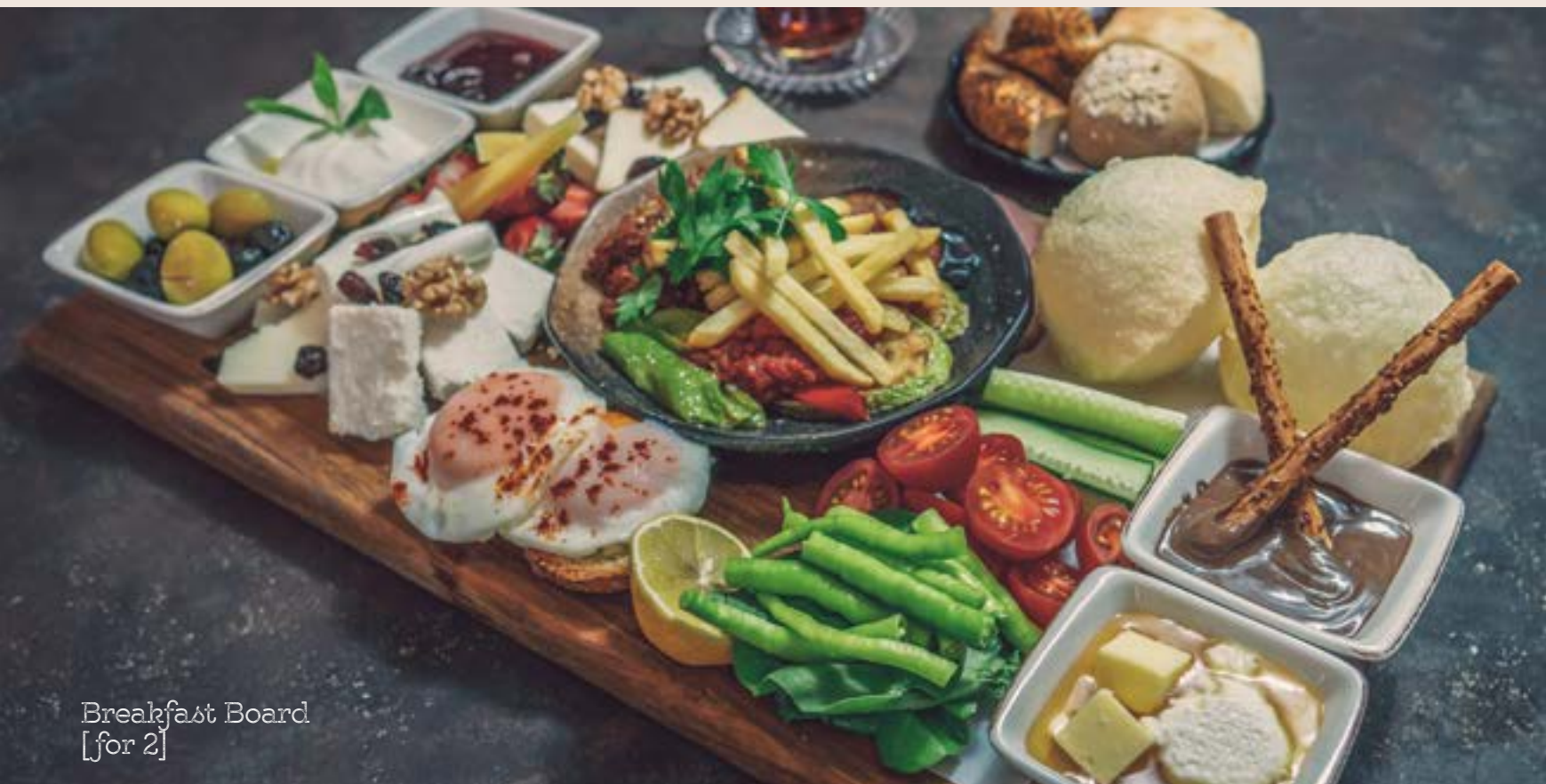
Breakfast Board [for 2]

Assorted cheeses, assorted olives, home-made jam, butter, honey, tomatoes, cucumbers, long green peppers, fresh greens, "Ankara simidi"