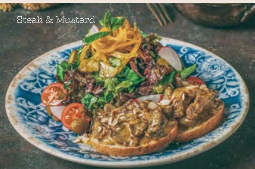
Steak & Mustard